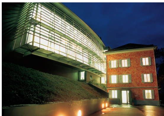
Headquarter of DACHCOM in Rheineck

The requirements was for a modern system solution through which the availability of employees and their user comfort when communicating could be increased and be administered centrally. It should also directly communicate with the Microsoft Exchange Groupware and be able to access the databases of Exchange. The very special requirement: As DACHCOM works to 90% with Macintosh systems, the solution must also function smoothly with both Windows und Mac OS X. In addition, the solution should be as future-secure as possible and offer a later expansion to VoIP. A possibility of managing Voice Mail centrally was also required. <